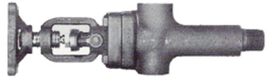
Q76 BL Gauge Valves

Renewable Seat: The removable seat may be replaced.